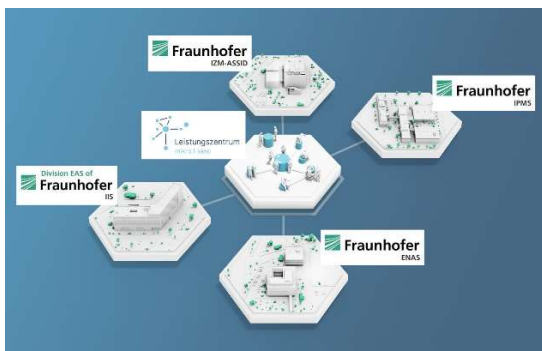
The High Performance Center Micro/Nano combines competencies of the core institutes Fraunhofer IPMS, ENAS, IIS-EAS and IZM-ASSID